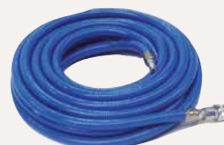
HOSE, BLUE FLEX (HALF)