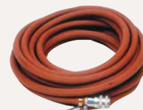
HOSE, RED RUBBER (HARR)

BLUE Flex and Red Rubber Hose Assemblies with Connector and Coupler fitted. Available in made-up lengths 10, 15, 20, 30 metres.